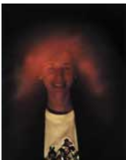
The first photo is taken before she put on a Shield.

These photos are called Kirilian Photography. They are showing the human energy field that is invisible to the naked eye, but kirilian film has the correct sensitivity to photograph this energy frequency. This series shows the remarkable strengthening, and protection wearing a Shield provides.