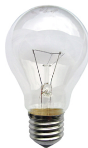
An incandescent light bulb produces light by heating a filament wire to a high temperature until it glows.

For a significant upgrade with your lighting that also cleans the air, check out Pure-Light Technology ... www.pure-light.com This technology significantly reduces bacteria, virus and odors, besides providing light. Please call or email us with any questions.