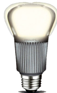
An LED contains electrons that recombine with electron holes, releasing energy in the form of photons and illuminating the bulb.