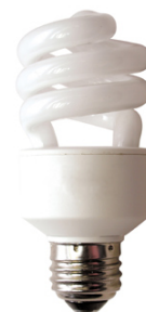
A CFL contains a mixture of argon and mercury gases that produces invisible ultraviolet light (UV) when the gas is excited by electricity.